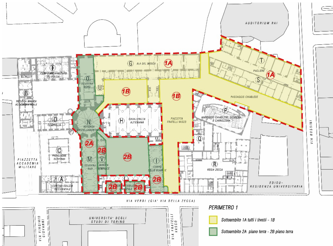
Fig. 1 - Perimeter 1 (see annex 1.3- Tables with perimeter area of Competition)

Area 1 consists of two sub-areas (1A and 1B):